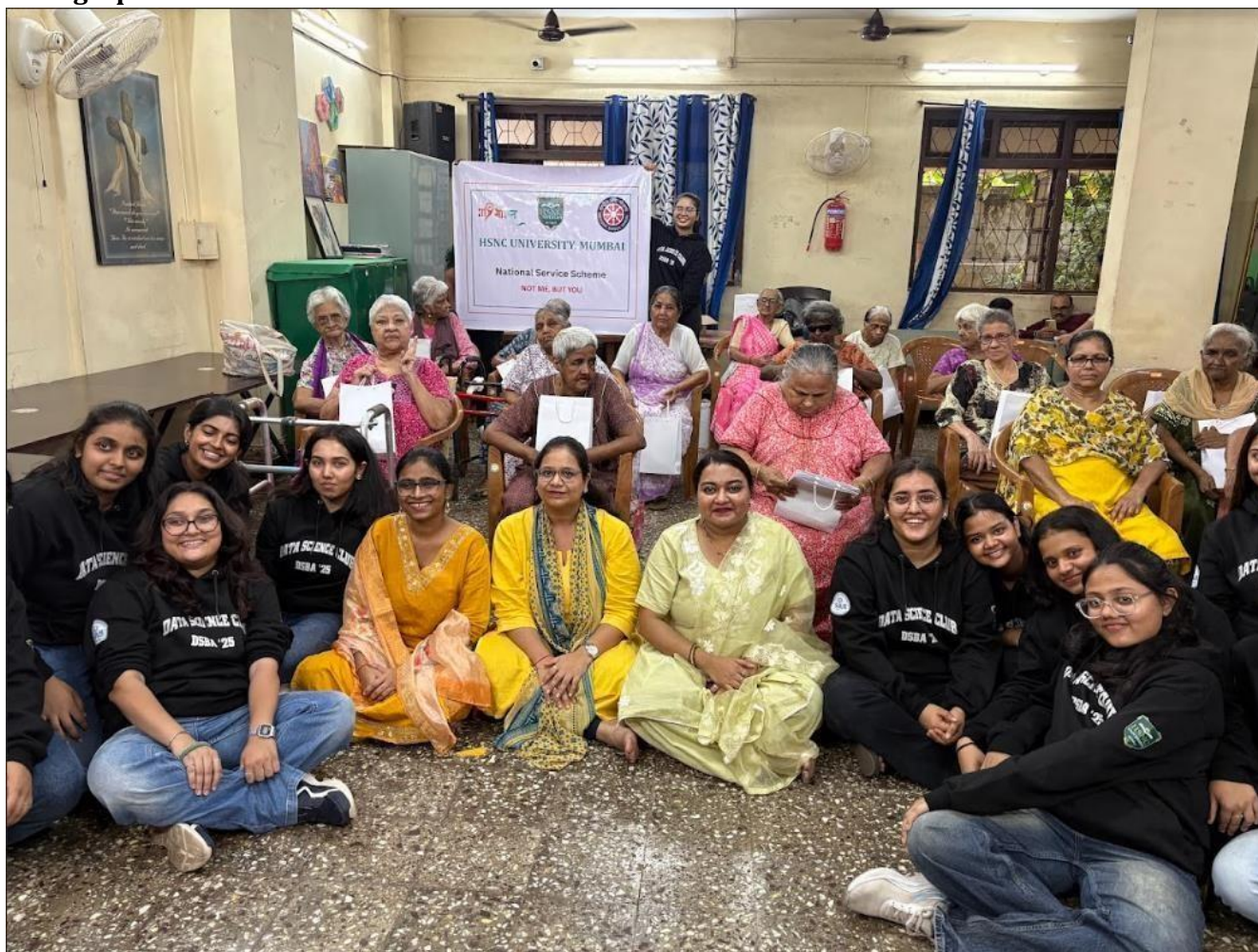
Photographs of the event: